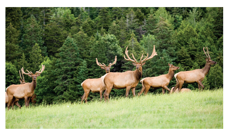
above Elk | cover Canoeing on the Saint Croix River | postal side Eastern bluebird, among the first songbirds to migrate back to Minnesota in spring

The Fond Du Lac Band of Lake Superior Chippewa has a proposal to reintroduce elk in northeast Minnesota near the Fond du Lac State Forest and the Reservation. This proposal is an exciting opportunity to restore part of the cultural heritage of many Native communities—while expanding the range of one of the most majestic animals on the Minnesota landscape.